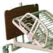
1/4 Length Side Rale