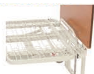
4" Bed Extender