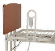
Pivoting Assist Bars